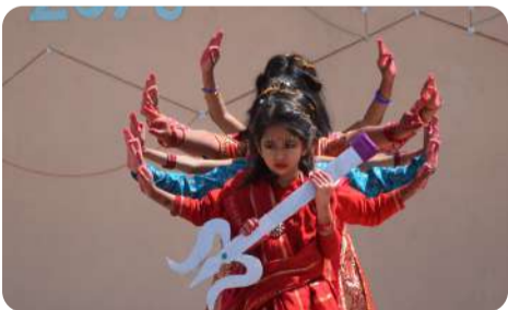
Students of grade I performing a Nawadurga dance.