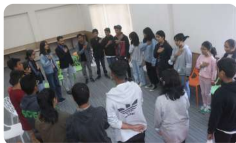
Member of IWS Student council singing the national anthem before a regular meeting.