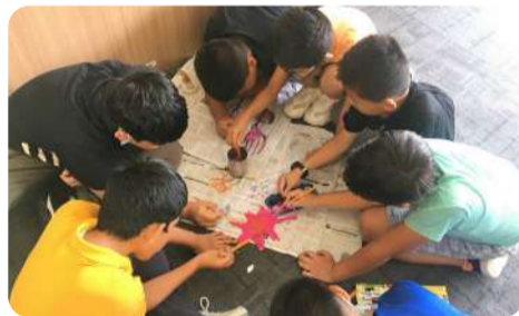
Students of grade V learning by doing the art work on their IPC exit point.