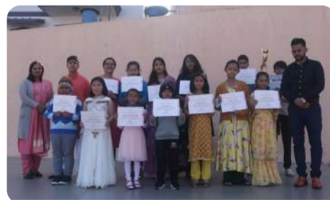
Students being awarded with certificates and medals.