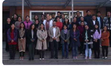
IWS teachers after attending a one day intensive Non-Violence Communication training.