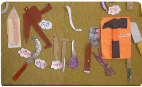
Action based Learning