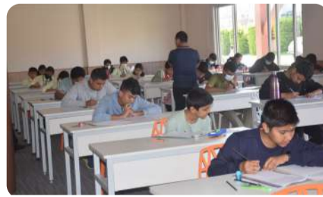
Students from various schools participating 9th edition of Iranian Geometry Olympiad at IWS.