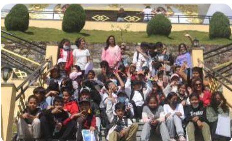
Students on an excursion.