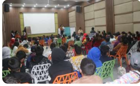
Junior wing participating on the Mathematics Trivia 2019.