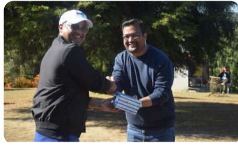
Winner of musical chair competition.