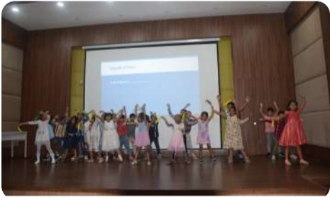
Grade I IPC exit point performance.