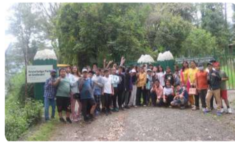
Field trip to ICIMOD.