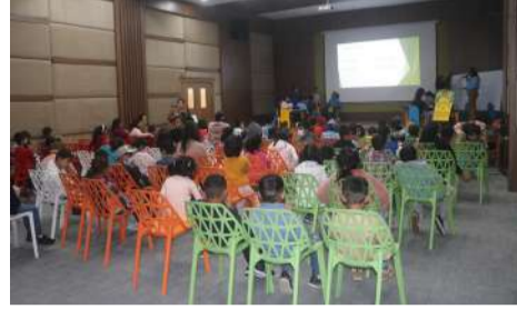
नेपाली हिजो प्रतियोगितामा सहभागी विद्यार्थीहरू