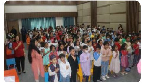
Enthusiastic learner all set to celebrate Children's Day.