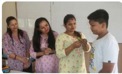
Student receiving Tika and Jamara.