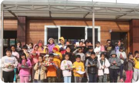
Students of grade II demonstrating the model of volcano.