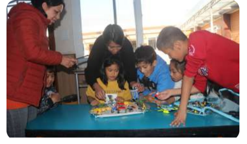
Grade III executing IPC tasks.