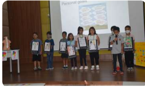
Grade II on IPC exit point.