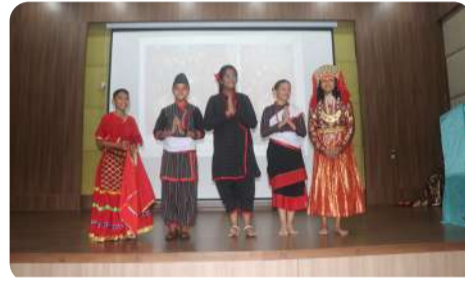
Students representing our rich culture and costumes.