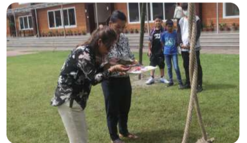
Our Principal Laying the foundation and inaugurating the swing.