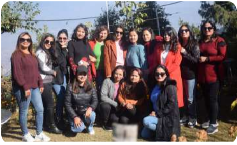
Teachers retreat at Ranikot Resort.